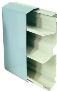
Cover bead under the base location bead.