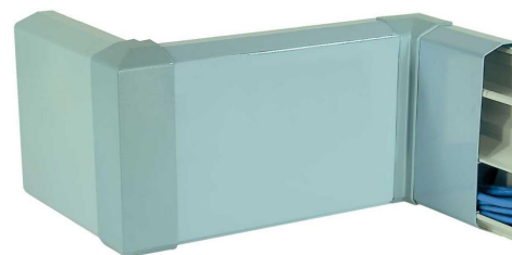
With modular corners fitted.